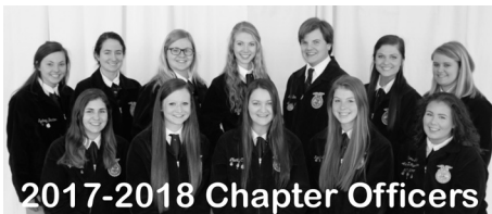
2017-2018 Chapter Officers