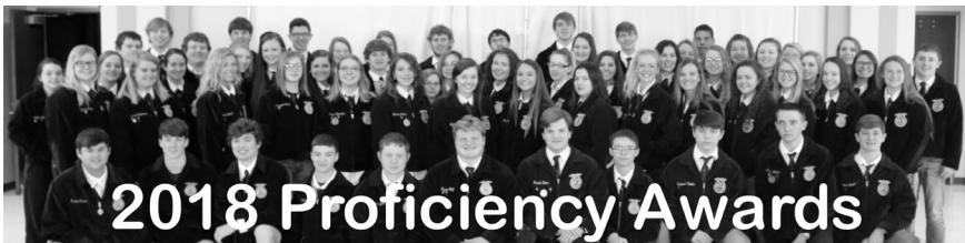
2018 Proficiency Awards