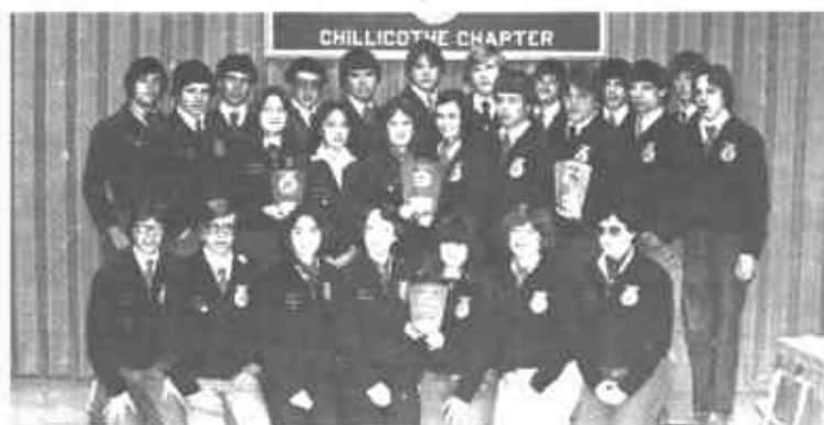
Winners of District Sweepstakes at Maryville