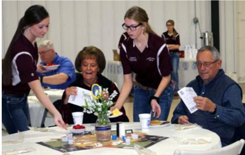
Salute to Agriculture Breakfast

Due to no school on Monday, February 18, we picked up the spirit of National FFA Week on Tuesday with dress-up spirit days. The dress-up days were: Tuesday - Camo Day (Salute to Veterans Day), Wednesday - Denim on Denim and/or Flannel Day (Salute to Farmers Day), Thursday - Dress like an Ag Teacher Day (Salute to Ag Education Day), and Friday - Official Dress (Salute to FFA Members Day).