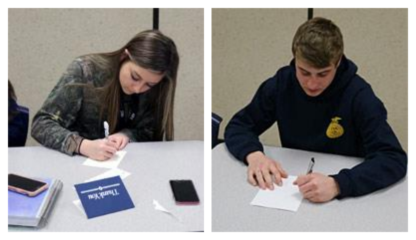
Writing Thank You Notes

Along with thank you notes and spirit days, the Chillicothe FFA conducted a coloring contest for elementary students to participate in, as well as presented high school faculty and staff with a gift of appreciation.