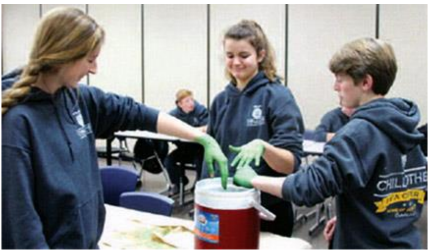
02 22 18

Related News - New Chillicothe FFA members got their first taste of proudly being FFA members by showing the rest of the school that they now are part of FFA. First-year members, also known as Greenhands, dyed their hands green on Tuesday at the Litton Agricultural Education Center on the Litton Agri-Science Learning Center campus. The dying of the hands was just one way these students could show that they now are part of the largest nationwide student organization. After dying their hands, the students went about their regular class schedule. The Chillicothe FFA chapter has 79 Greenhands this year and is celebrating National FFA Week this week.