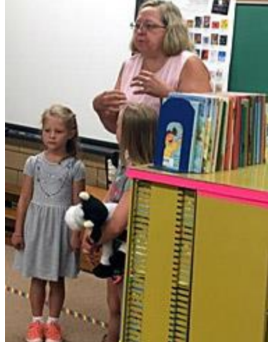
Return to Top