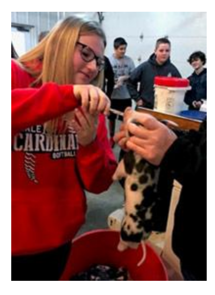
Ag Science I & II January, 2018

Students from the Ag Science I and Animal Science classes at the Litton Agriculture Education Center were having a hands-on learning experience at the Litton Agri-Science Learning Center during January. The students were learning about animal reproduction in class and then were experiencing the real thing in person. While at the Litton Ag Campus, the students gave the newborn baby pigs an iron shot, ear notched, clipped tails, and cut needle teeth. The students during first semester were in charge of charting the heat cycle, expected pregnancy date, name of sire, and day of artificial insemination for some of the sows housed at the Litton Agri-Science Learning Center.