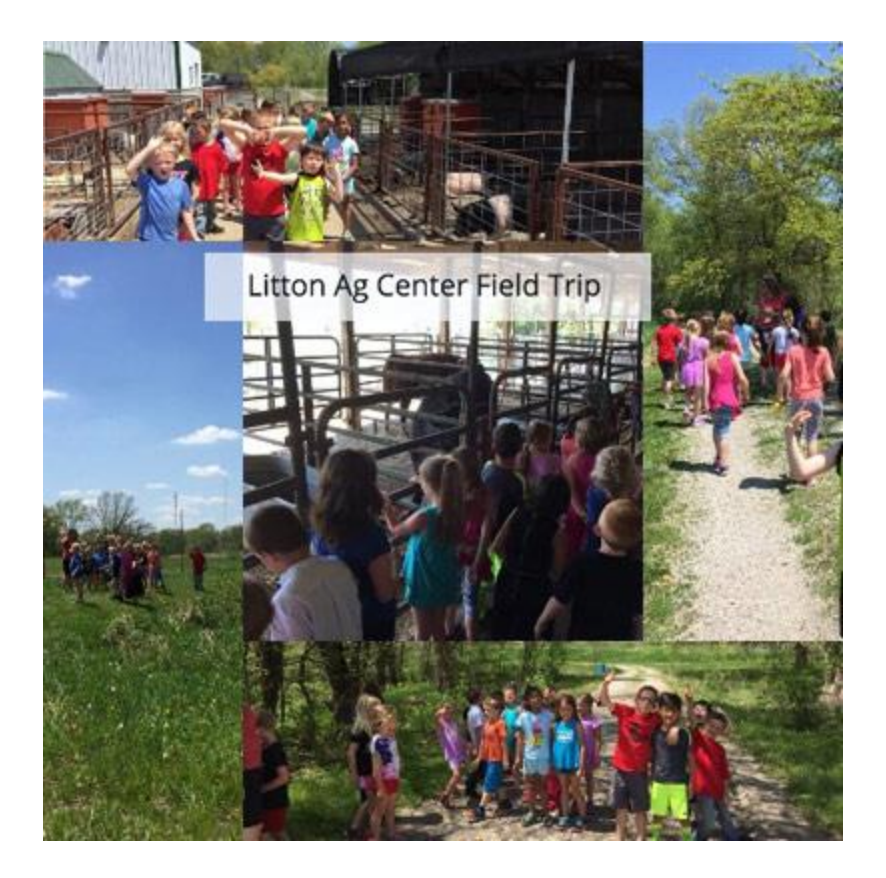
Return to Top