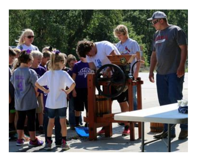
Return to Top