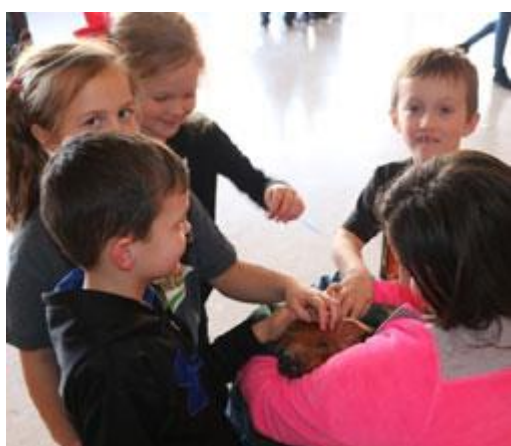
Return to Top