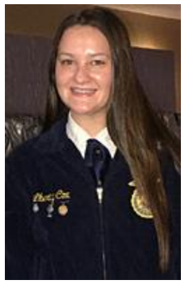
Return to Top