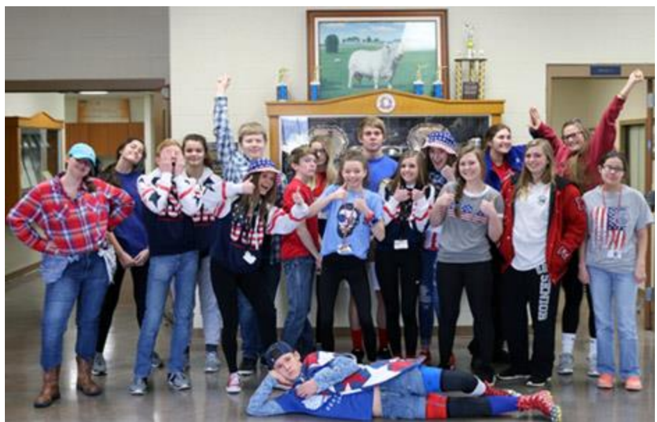
American Dress-Up Day

Throughout the years, the Chillicothe FFA Chapter has been involved in many activities; this year was no exception. On Friday, February 16th, our chapter partnered with the Chillicothe Chamber of Commerce to host the annual Appreciation Breakfast. This is an event the Chillicothe FFA does to give back to the community and show how much they mean to us. On Sunday, February 18th, our chapter attended Lifepoint Church for a morning service. Every member that attends church wore official dress. Some members read scripture and collected the offering.