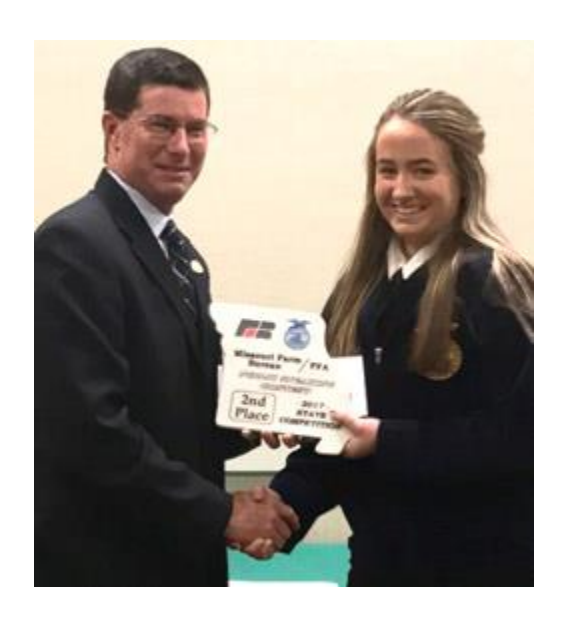
Return to Top