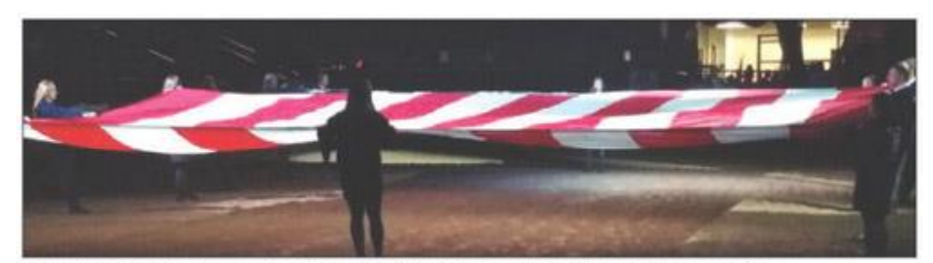
Chillicothe FFA Chapter members unfurl the American flag at the National FFA Convention.

October 25, 2017 - 6,800 people were sitting in the dimly lit Indianapolis Farmer's Life Coliseum as nervous teenagers carry a massive ribbon into the center of the dark arena. The lights brighten, the National Anthem begins, and they all, simultaneously, make one movement backwards, unveiling the American Flag across the entire arena. Everyone is standing; and it is truly an amazing moment for those teenagers and breathtaking for the audience. Those members were from the Chillicothe FFA Chapter, and their lives had just been changed forever.