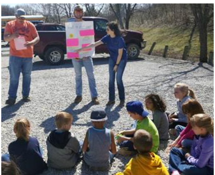
Return to Top