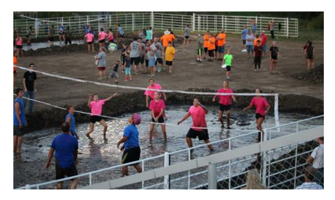
Return to Top