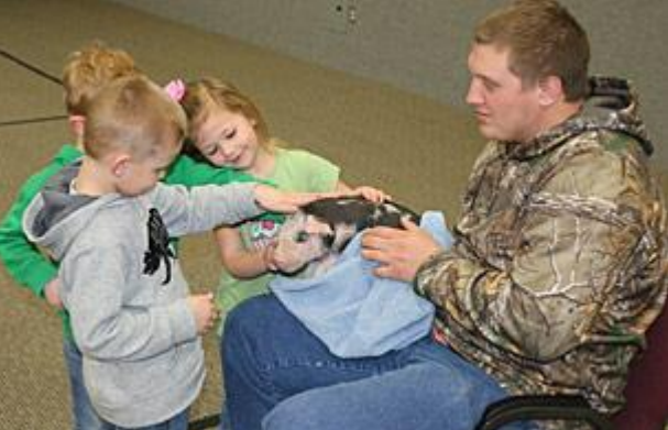
Return to Top