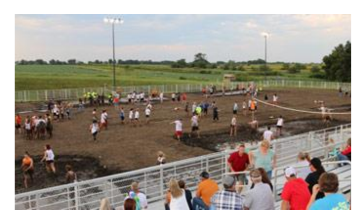
2nd Annual Mud Volleyball Tournament 09/02/15

On September 2, 2015, the Chillicothe FFA Chapter held its second annual Mud Volleyball Tournament. The tournament consisted of a 30 teams with a double elimination event. There were 285 members and spectators present at the tournament with pork burgers and chips provided for all. The team members consisted of FFA members, FFA Alumni, parents, and staff. The tournament was held to encourage a fun atmosphere for freshman members to help them become more acquainted with upperclassmen as well as fuel a little friendly competition. The members would like to thank the parents who helped prepared food as well as the parents and staff who participated in the tournament.