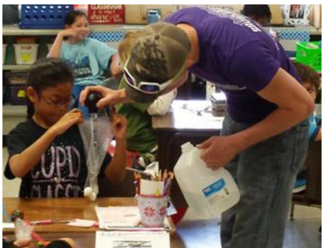
Growing Seeds in a Glove