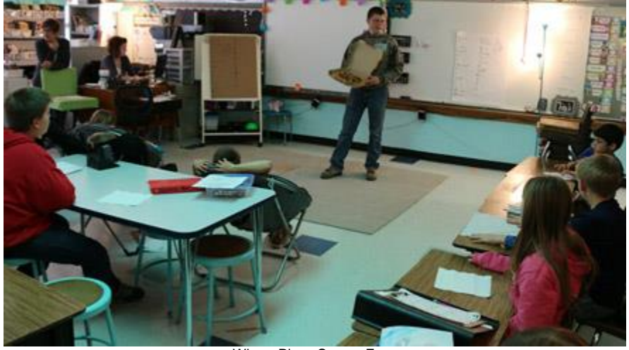
Where Pizza Comes From

Agriculture Education on the Move is a hands-on education program identifying key classroom objectives and state standards primarily in the areas of science, math, reading and writing. Students gain an understanding of today's agriculture and farm families through diverse learning experiences. Participating classrooms have the opportunity to learn about crops, livestock, soil and water conservation, nutrition and agricultural careers. Students engage in agriculture in a fun and exciting way by planting seeds, experimenting with yeast and bread making, creating corn plastic, rock 'n' roll ice cream and more.