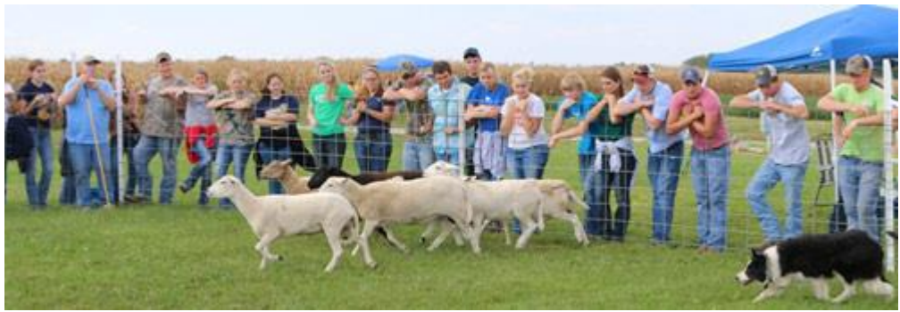
Training Dogs for Farm Work Demo

The students had the opportunity to visit 19 learning stations which included: Fire Safety, Computers on the Farm, Soil Pit Demo, Drones for Ag Use, Fistulated Cow, Scouting Corn & Soybeans, Precision Ag, Preparing for College, Sport Turf Management, Selecting Forages, Highway Patrol Demo, Soil Erosion Demo, Cover Crops, Training Dogs for Farm Use.