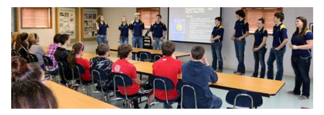
Return to Top