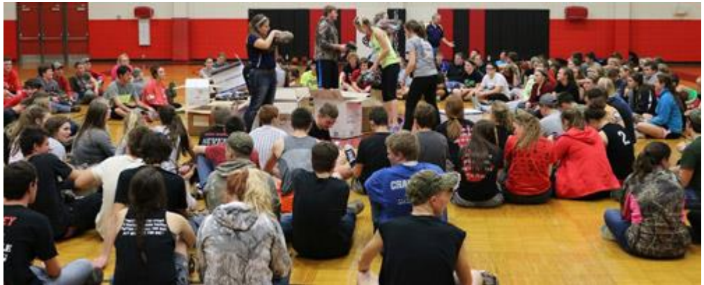
Passing out Barnwarming Incentives

The students also held a canned food drive and collected nine boxes of canned food items along with money for the Meals of Hope program.