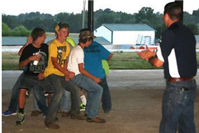
FFA members playing the human chair game