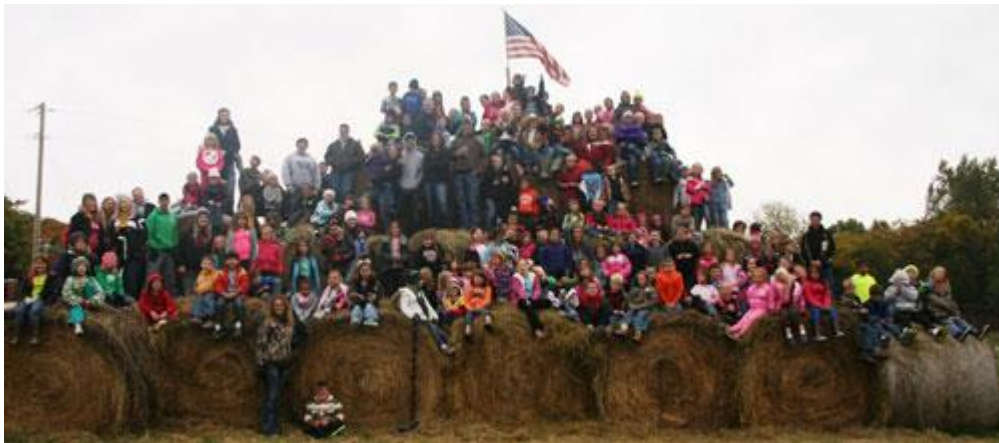
Dewey 1st Grade

Students from all the Kindergarten and First Grade classes at Dewey Elementary School were having a hands-on learning experience at Papa Charlie's Pumpkin Patch on October 17 and 18, 2013. The students learn about agriculture in the classroom through their regular curriculum and assistance from the Litton Crusaders program. During the school year, students will learn all about animals on the farm, crops grown on the farm, and what farmers provide to the general population.