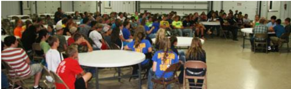
FFA members watching the skit provided by the assistant officer team.

Chillicothe FFA Chapter held their annual August meeting Wednesday night, August 28, 2013. The meeting was held at the Litton Agriculture Campus and served as a new member orientation. FFA advisors report there are 74 new freshmen, and 64 of the new members attended. There were about 263 FFA members and parents present. Attendees enjoyed the FFA opening ceremonies presented by the Chapter Officers. The group was then broken into two groups - parents and students. The parents were given an overview of what to expect as an FFA parent.