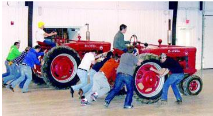
02 21 12

Chillicothe agriculture education students gathered in the Mervyn Jenkins Expo Center Tuesday to compete in the Ag Olympics as a part of National FFA Week. Participants in the Olympic games had to push a tractor (above), hammer a nail into a 2-by-4 block of wood, transport a teammate via wheelbarrow, carry two hay bales, split wood with an ax, and team up to walk on ski-planks towards the finish line.