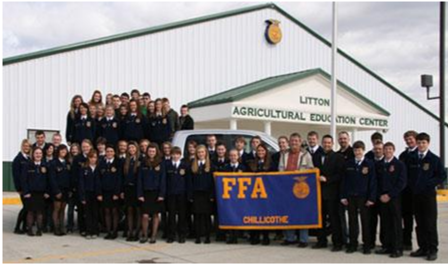
Group of FFA Members with Woody's Representatives