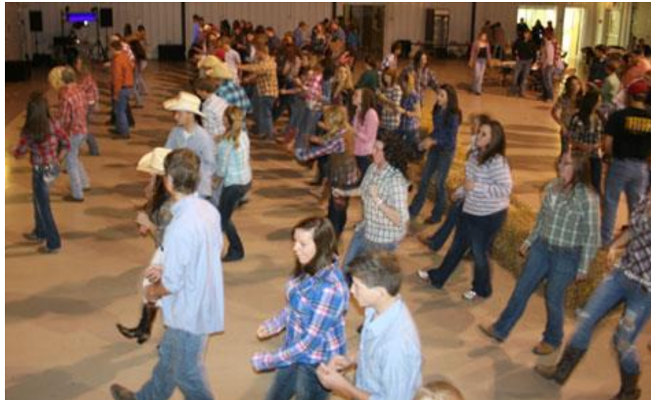
Students line dancing at Barnwarming!