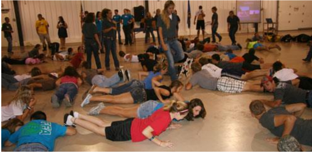
Students participating in a game called "Ships and Sailors" conducted by the officer team.