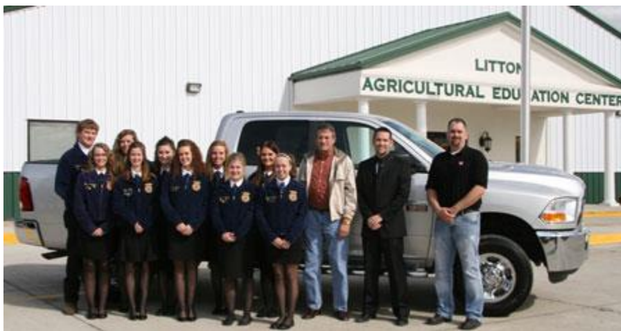
FFA Officers with Woody's Representatives