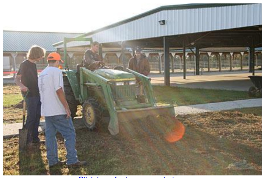
Click here for two more photos...

The Ag Power and Structures and Ag Construction II classes in the agricultural department at the Litton Agriculture Education Center are assisting in the construction of new concrete around the Litton Agriculture Campus.