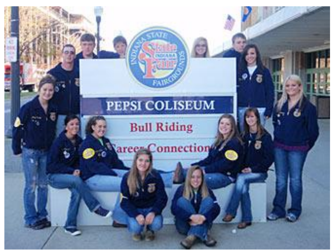
Click on photo to see a closer view...

The National FFA Organization, formerly known as the Future Farmers of America, is a national youth organization of 523,309 student members - all preparing for leadership and careers in the science, business and technology of agriculture - as part of 7,358 local FFA chapters in all 50 states, Puerto Rico and the Virgin Islands. The National FFA Organization changed to its present name in 1988, in recognition of the growth and diversity of agriculture and agricultural education. The FFA mission is to make a positive difference in the lives of students by developing their potential for premier leadership, personal growth and career success through agricultural education.