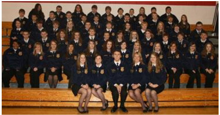
Click photo to see a closer view.

On Wednesday, January 6, 2010, sixty-three (63) Chillicothe FFA Freshman attended the Northwest District Greenhand Motivational Conference at the North Central Missouri College Campus in Trenton, Missouri.