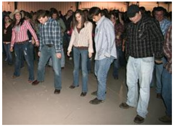
Pictures: Students dancing at our festivities; FFA member; Freshman boys playing their game - getting a Carmel apple or Carmel onion; Sophomore girls reaching in a pumpkin full of worms to get a game piece.