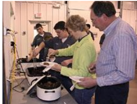
CAPTION: Chillicothe FFA members and supporters alike line up for breakfast at the Mervyn Jenkins Expo Building this morning (Friday).